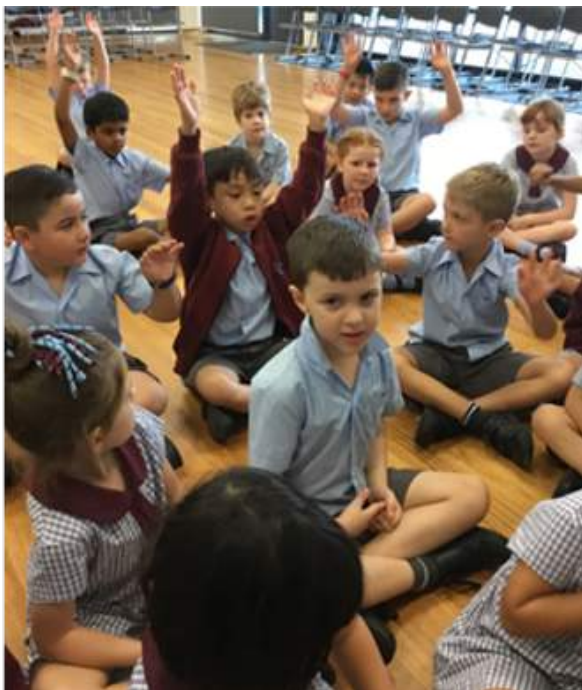
Stage 1- Singing to the song 'Reach for the stars'