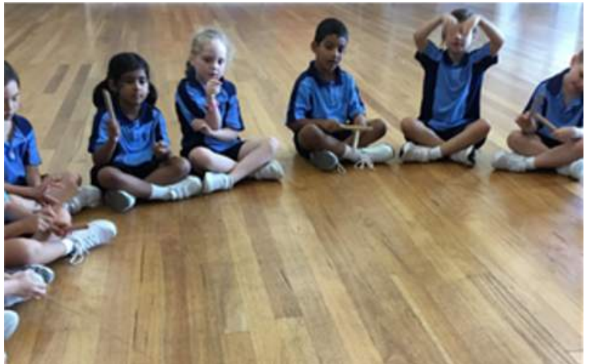
ES1 Learning to play the beat

Each lesson incorporates a variety of musical skills that are presented as a warmup, followed by a lesson where students engage in music through listening, making and playing.